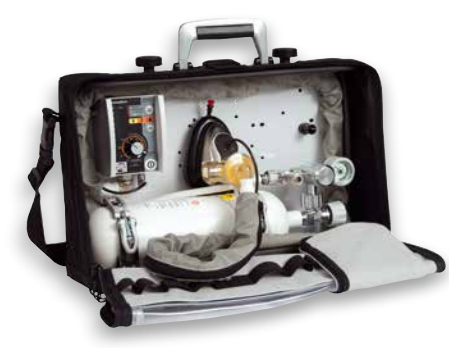
LIFE-BASE III with MEDUMAT Easy CPR (WM 9155)