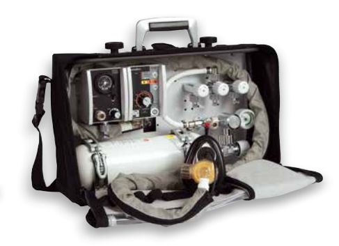
LIFE-BASE III MCI with MEDUMAT Easy CPR, MODUL Oxygen and 3-way distributor (WM 8000)