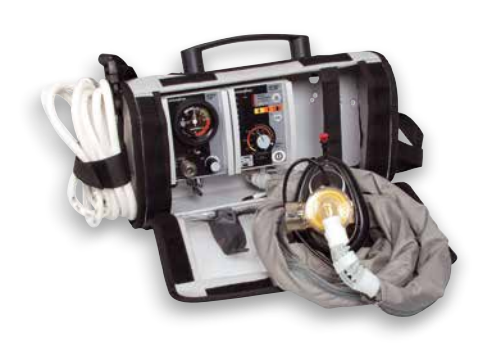
LIFE-BASE light With MEDUMAT Easy CPR and MODUL CPAP (WM 28235)